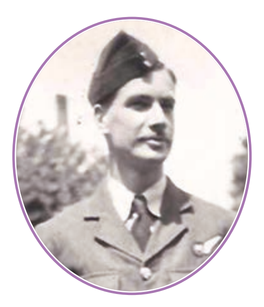
To Celebrate the Life of