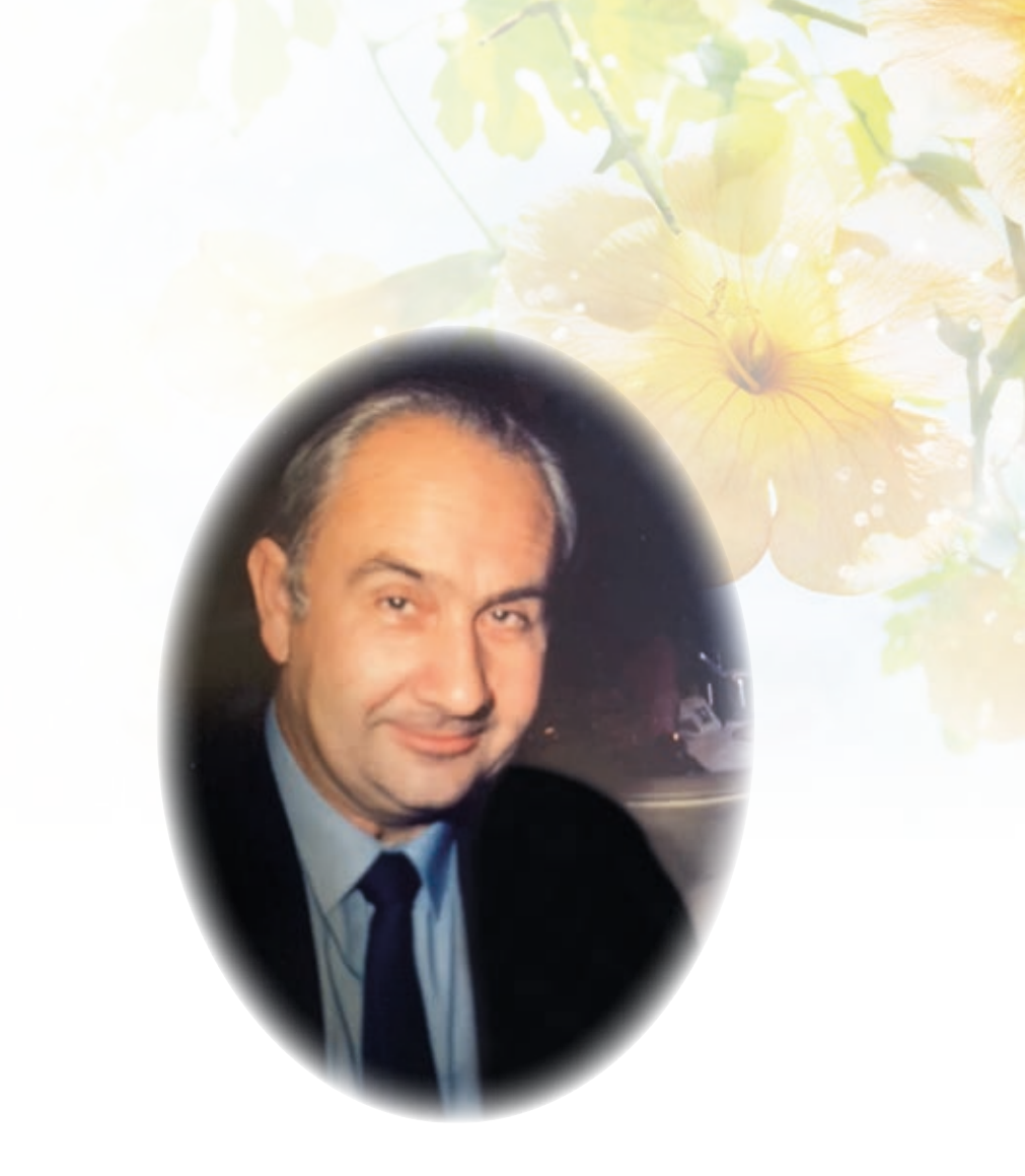
EXIT MUSIC A Kind Of Magic Queen