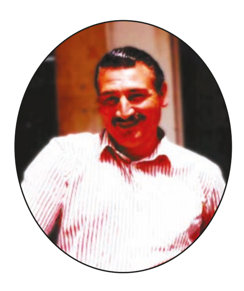
In Loving Memory of