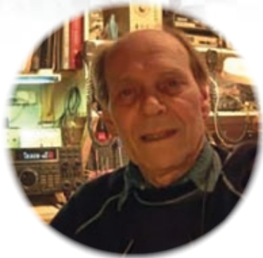
G3UPA signing off