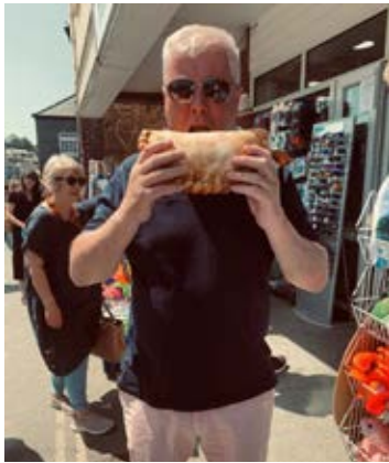
'One of a kind, One in a million'

The family would like to thank everyone for their kind words and support at this sad time.