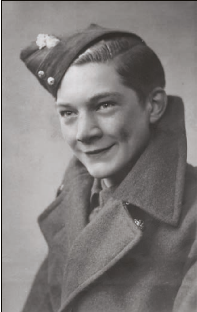
Home Guard, February 1941