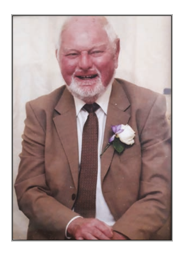
Order of Service