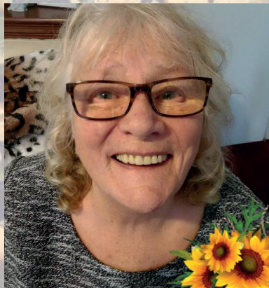
Always Our Sunshine