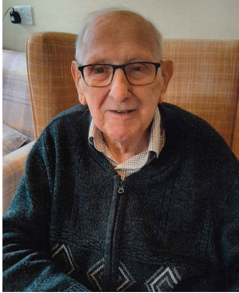
Finborough Court 2020