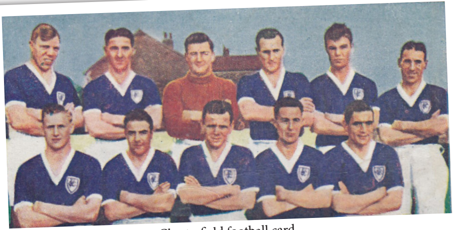
Chesterfield football card