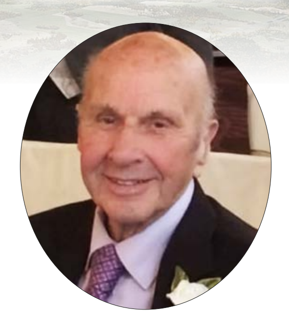
Friday 30th December 2022 at 3.00 pm Mansfield Crematorium, Newstead Chapel