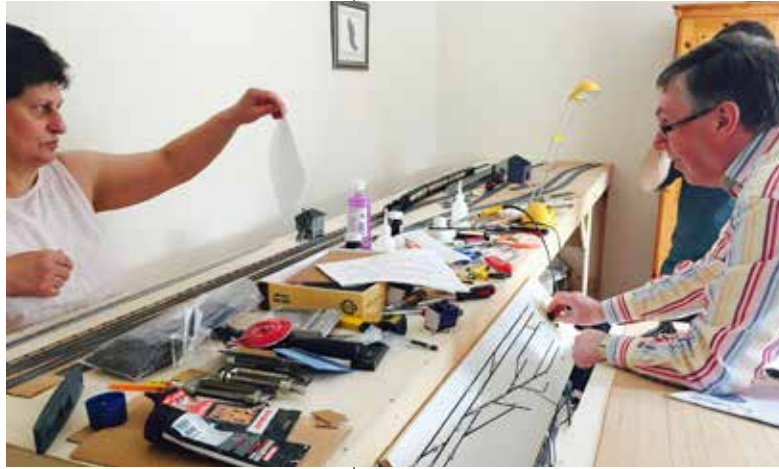
May 2016. At home. Building his train set.