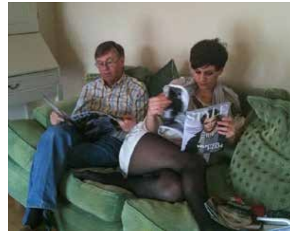
2009. At home. The Sunday Times.