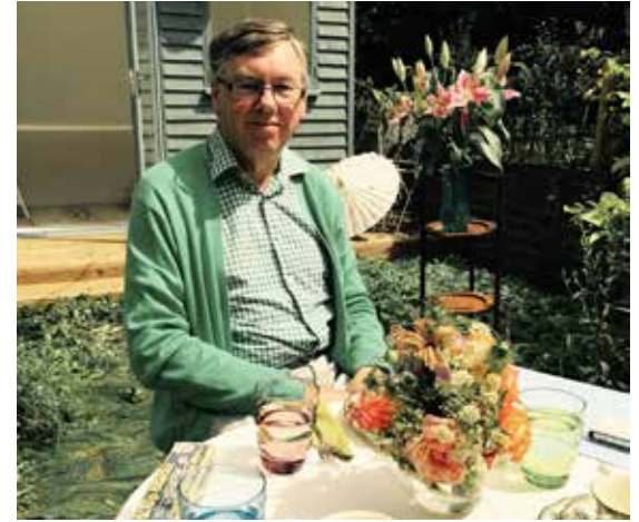
June 2016. Father's Day.