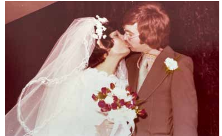
21st October 1975.