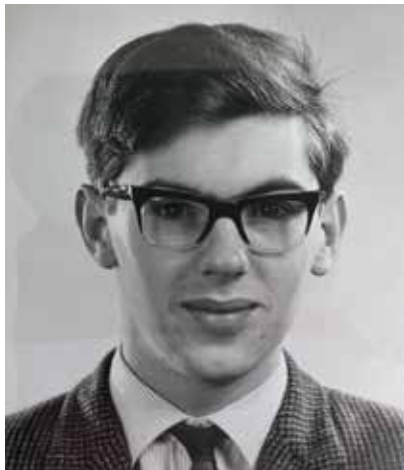
1966. Aged 18.