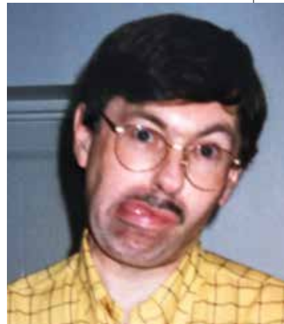
1995. At home – making faces!