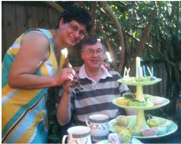
June 2011. Father's Day.