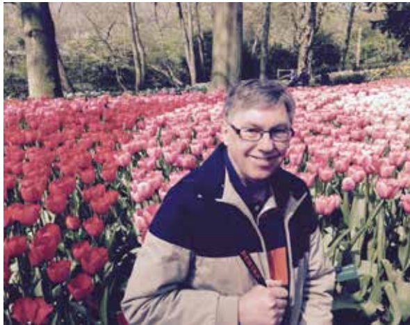
May 2015. Amsterdam Tulip Festival.