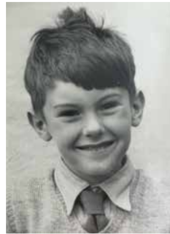
1955. Aged seven.