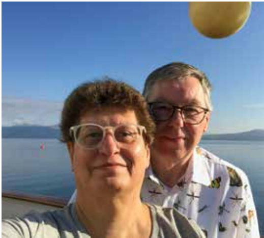
April 2019. Cruising the Norwegian Fjords.