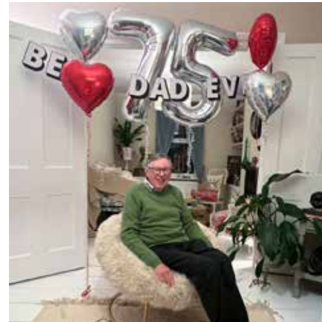
October 2022. Happy 75th Birthday!