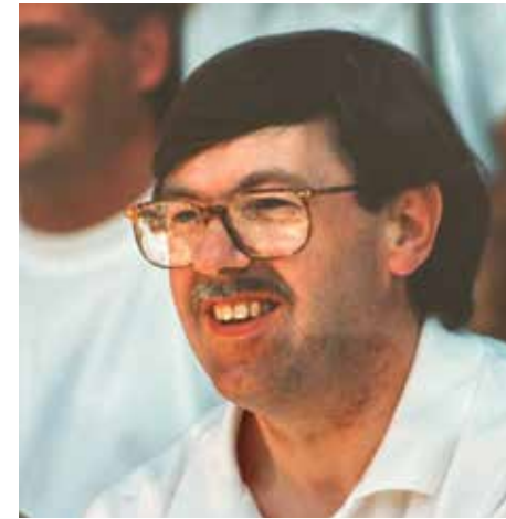
1990. Seaworld, Los Angeles.