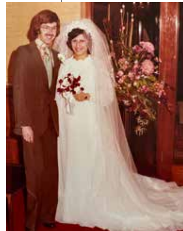
21st October 1975.