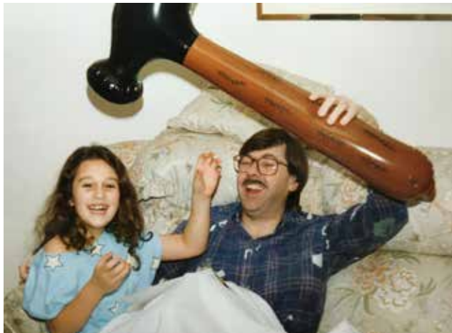
1991. At home.