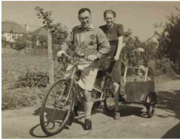
1948. With Mum and Dad.