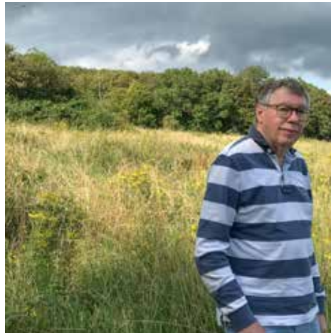
August 2021. Brighton.