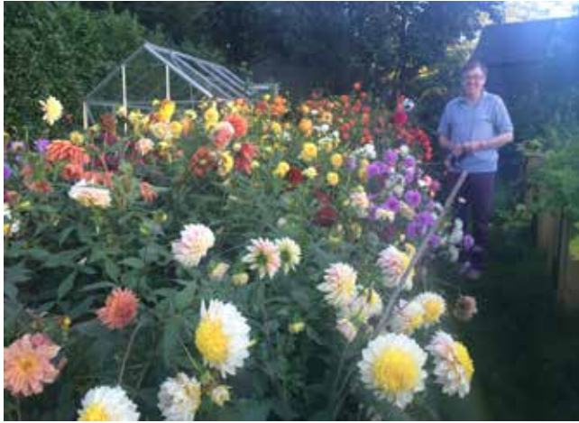
August 2015. At home. The proud gardener.