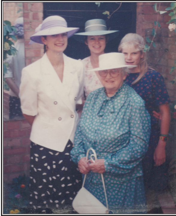
The Goodbrook Girls on their way to Buckingham Palace