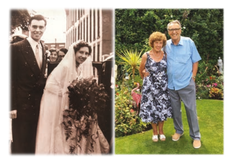
The family would like to thank everyone for their kind words and support at this sad time.

Memorial donations for Cancer Research UK may be left in the box provided on leaving the service, sent care of A.W. Lymn The Family Funeral Service or left online at www.lymn.co.uk/obituaries