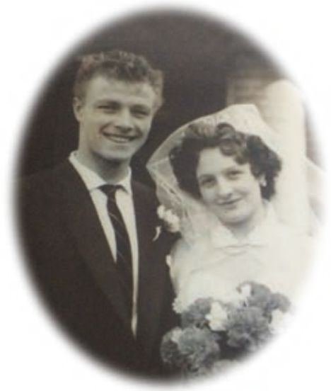
'Best day of our lives'