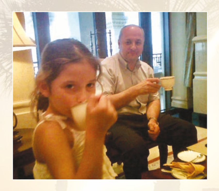
Order of Service