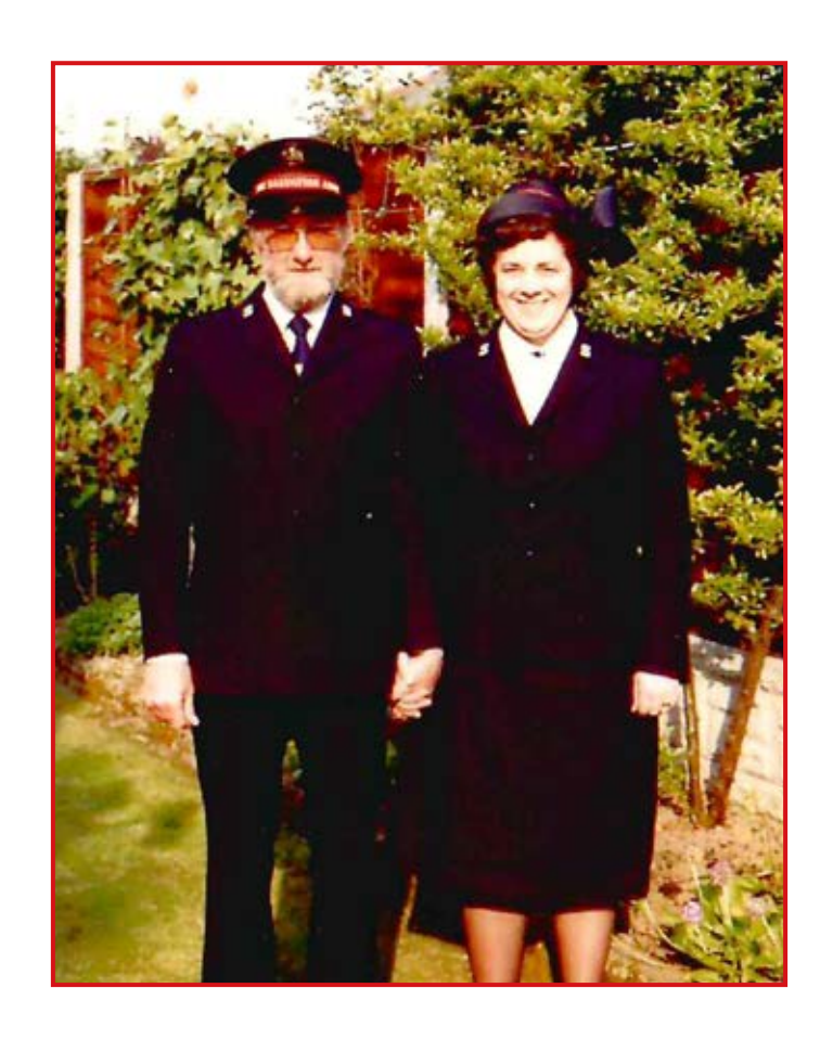
Order of Service