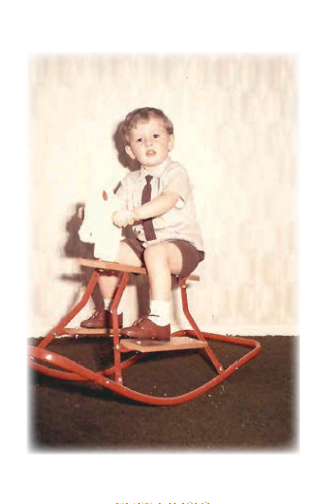
EXIT MUSIC God Put A Smile Upon Your Face by Coldplay