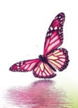
'Honey' by Bobby Goldsboro