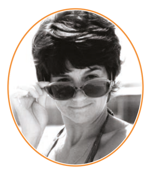
To Celebrate the Life of