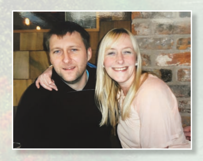
Order of Service