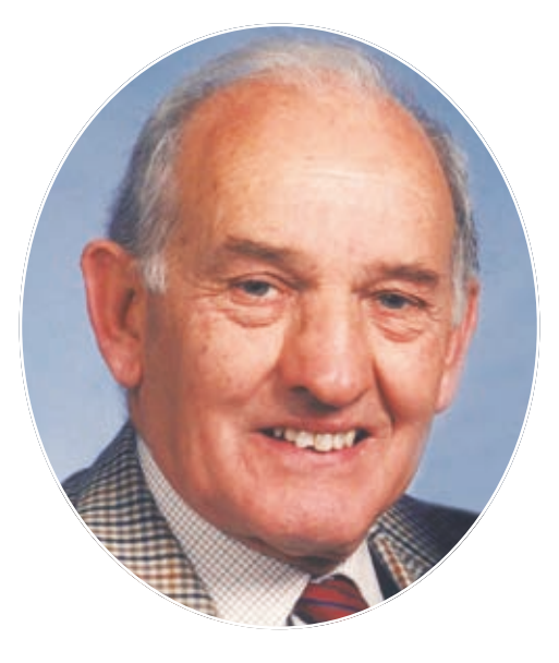
To Celebrate the Life of