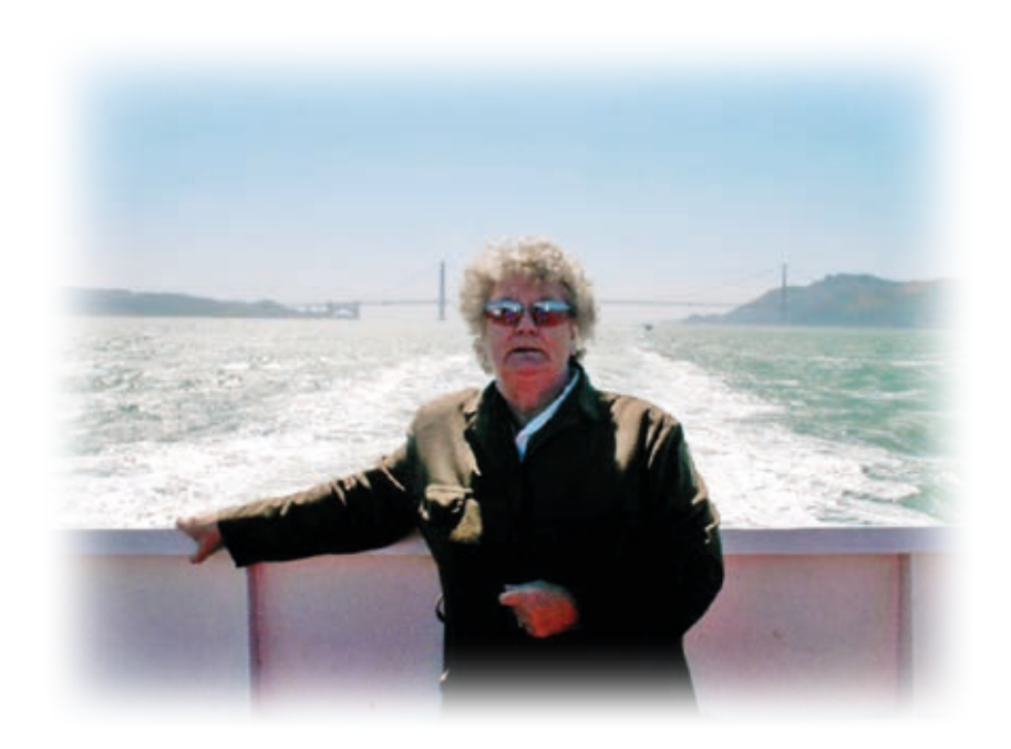
Mum speeding away from the Golden Gate Bridge

The family thanks you for your support today and ask you to join them at 28 Egling Croft, Colwick, Nottingham NG4 2DB for refreshments, after the service.