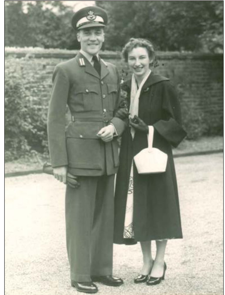
Having met on a bomber airfield in 1949 saw the beginning of a nearly 60 year relationship