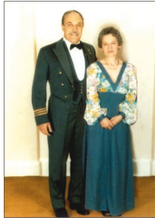
Commanding a Wing at RAF Scampton, 1981