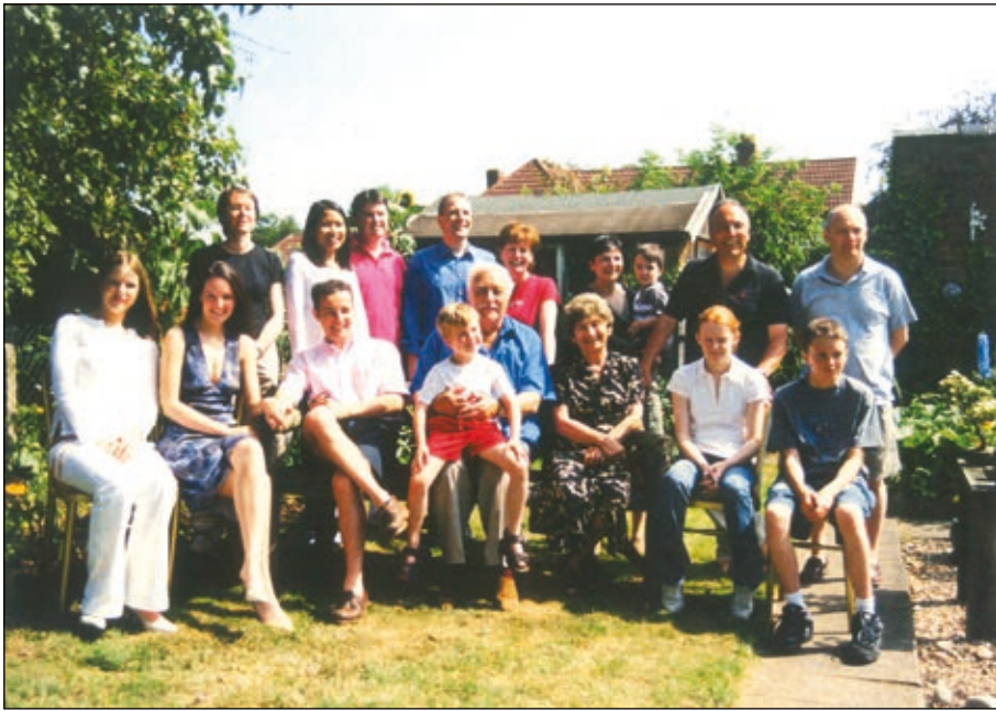
A Family Man