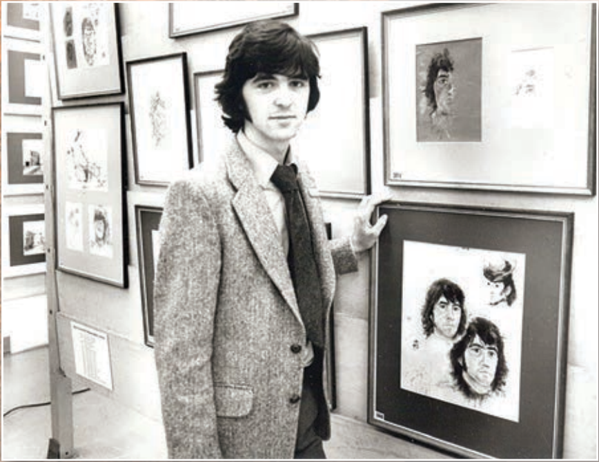
Winner of the Major Award in the National Exhibition of Children's Art at The Mall Gallery January 1978