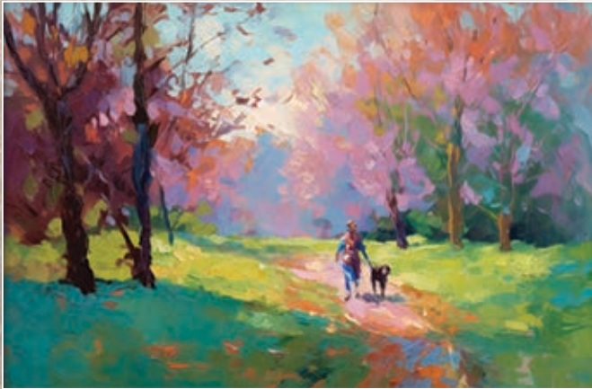
Early morning Spring walk 2022