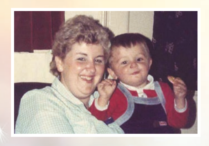
Order of Service