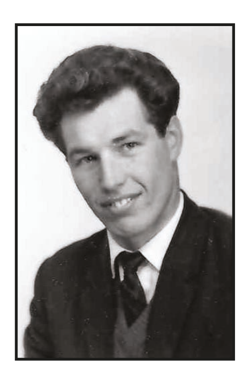
At Michael's request a retiring collection is to be shared between the Lincs and Notts Air Ambulance and Rempstone Church.