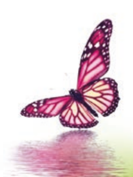
May the grace of our Lord Jesus Christ the love of God, and the fellowship of the Holy Spirit be with us all, now and for evermore. Amen.