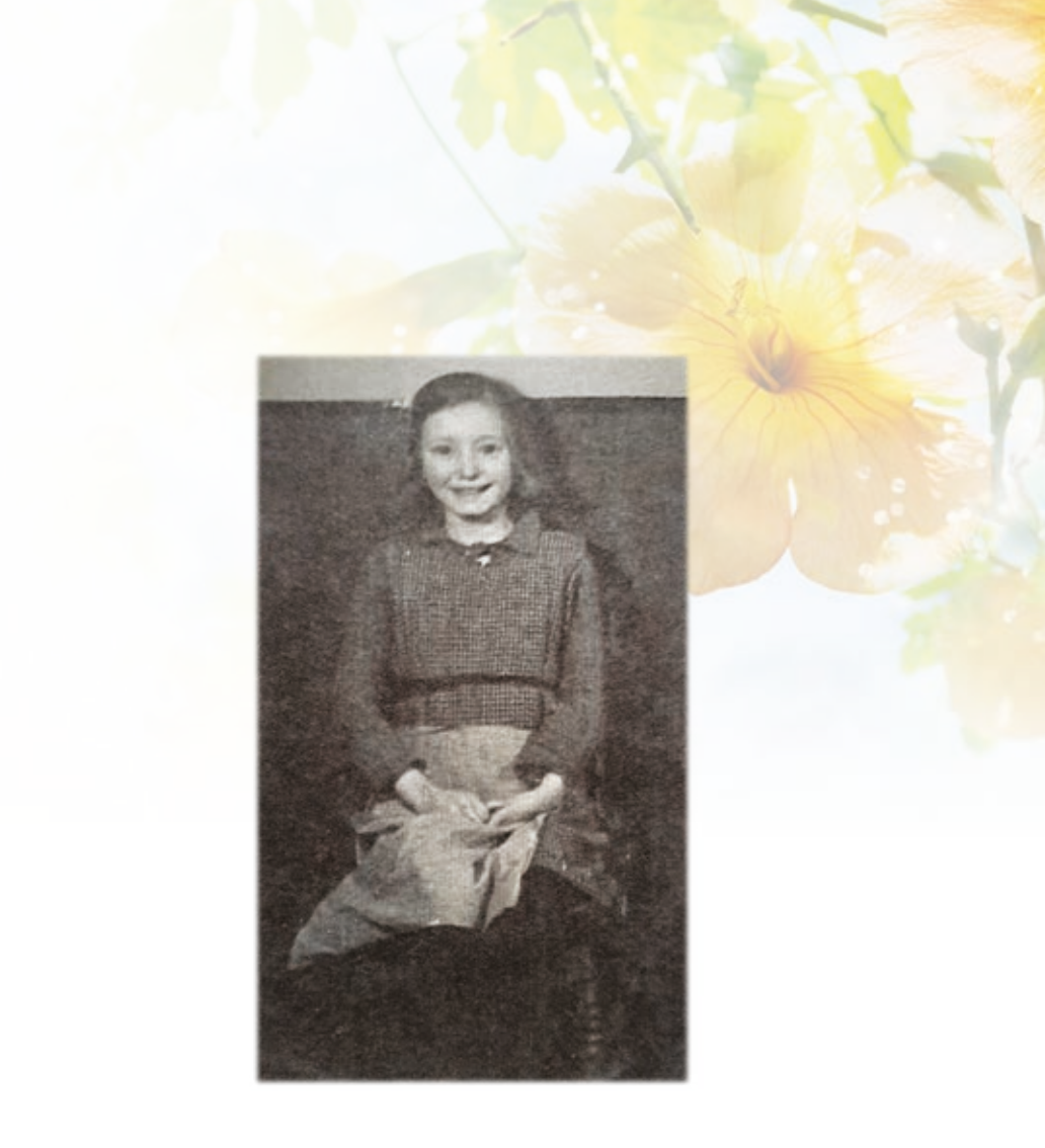
REFLECTION MUSIC Unforgettable - Nat King Cole