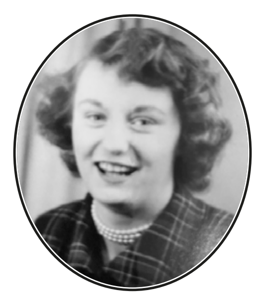
To Celebrate the Life of