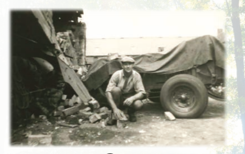
Poem Miss Me, But Let Me Go