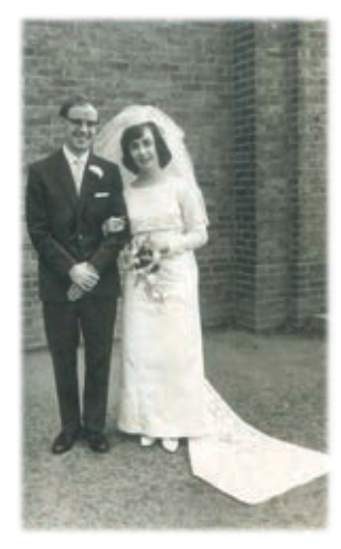
Thank you for coming.

You are all welcome to join us for refreshments at the Greyfriars Social Club after this Mass.