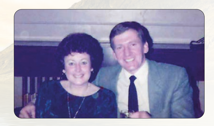
Always in our hearts, Forever in our thoughts.

Our Father, who art in heaven, hallowed be Thy name; Thy Kingdom come; Thy will be done, on earth as it is in heaven. Give us this day our daily bread. And forgive us our trespasses, as we forgive those who trespass against us. And lead us not into temptation, but deliver us from evil. For Thine is the Kingdom, the power and the glory, for ever and ever. Amen.