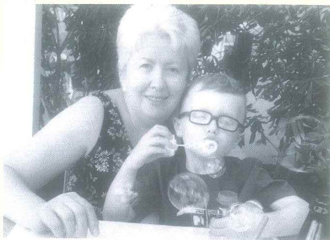
Love you Granny