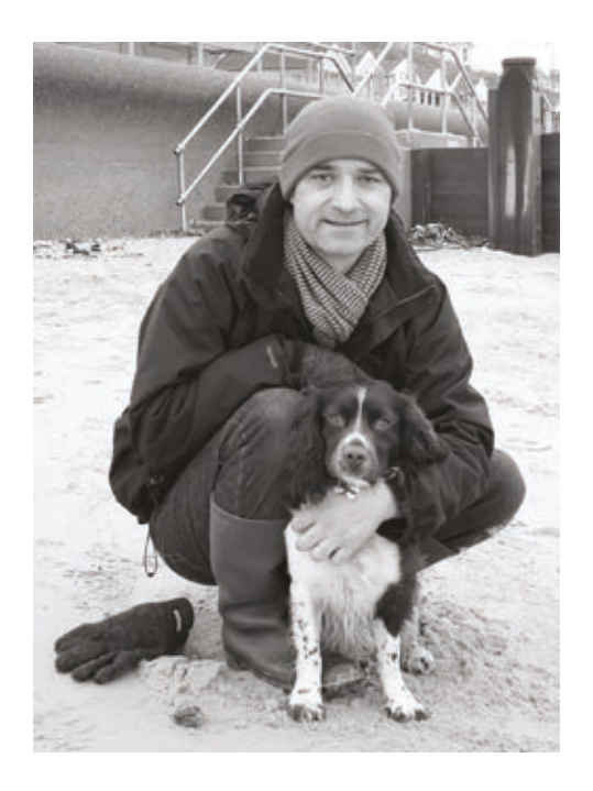
In Loving Memory of